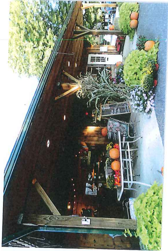
Staehly Farm Winery, March 2016, Photo Source: Staehly Farm Mgmt

East Haddam has been making great strides in supporting the agricultural businesses that contribute to the preservation of the Town's farmland and agricultural heritage. Farmland preservation provides economic, ecological and social benefits to the Town, its residents and its visitors. Promoting local small family owned businesses and their long-term economic viability contributes to the tax base and draws in valuable agritourism dollars. These farms also