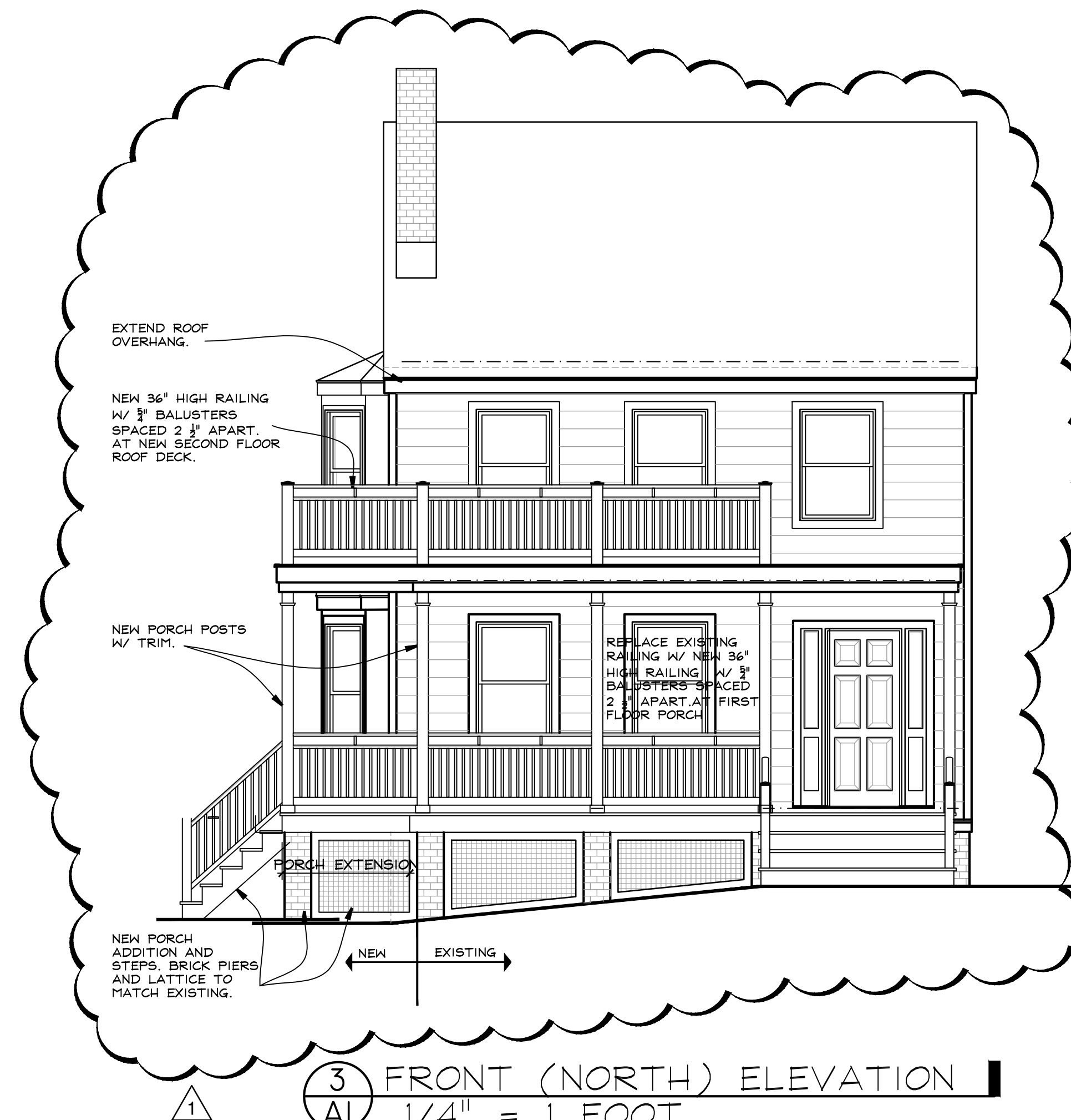
3 FRONT (NORTH) ELEVATION 1/4" = 1 FOOT