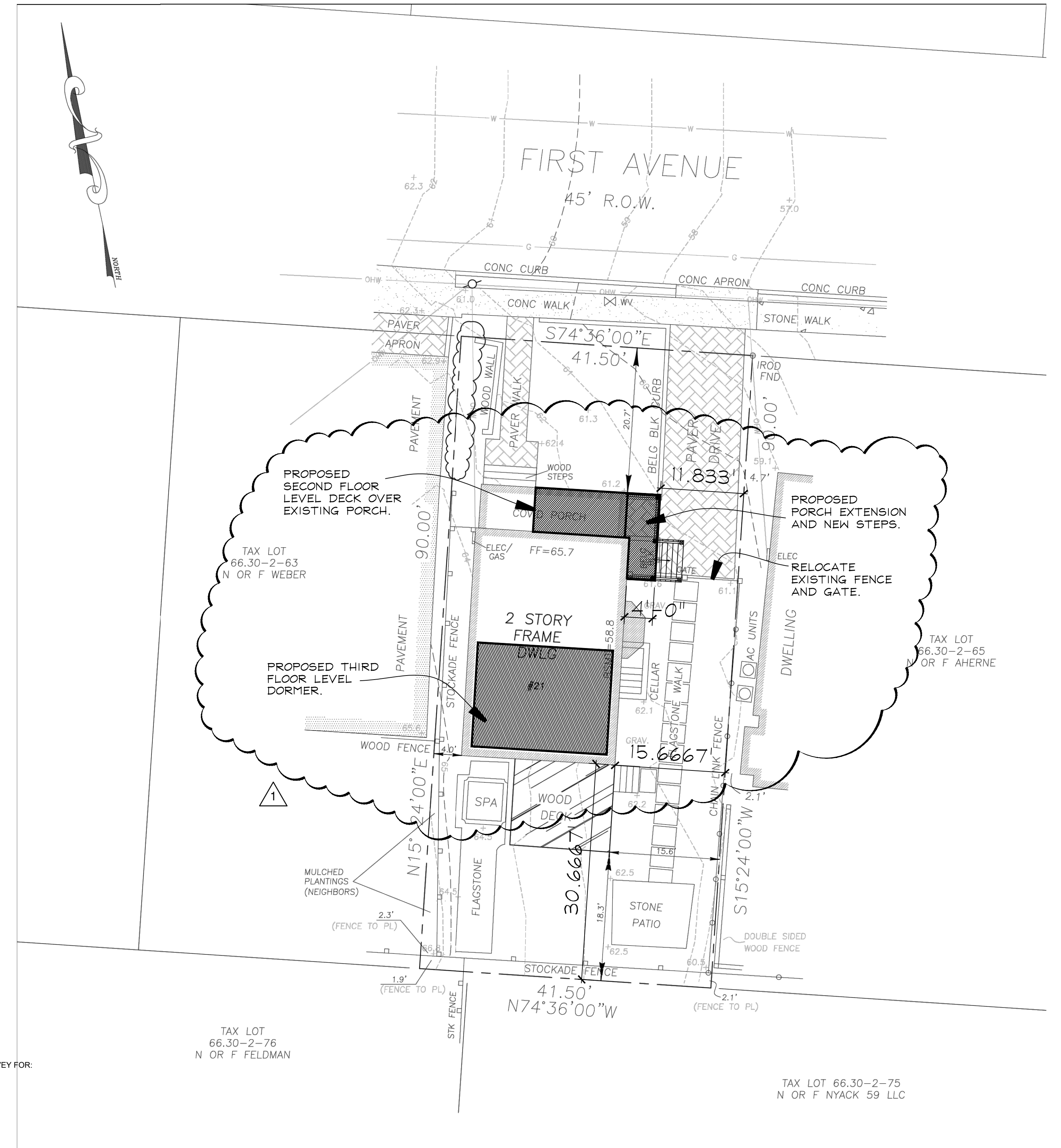
① SITE PLAN C 1 INCH = 10 FEET

JAY A. GREENWELL, P.L.S., LLC LAND PLANNING - LAND SURVEYING 85 LAURELTON AVENUE, SUFFERN, NEW YORK 10901 PHONE 845-357-0830 FAX 845-357-0756 © 2021 JAY A. GREENWELL, P.L.S., LLC