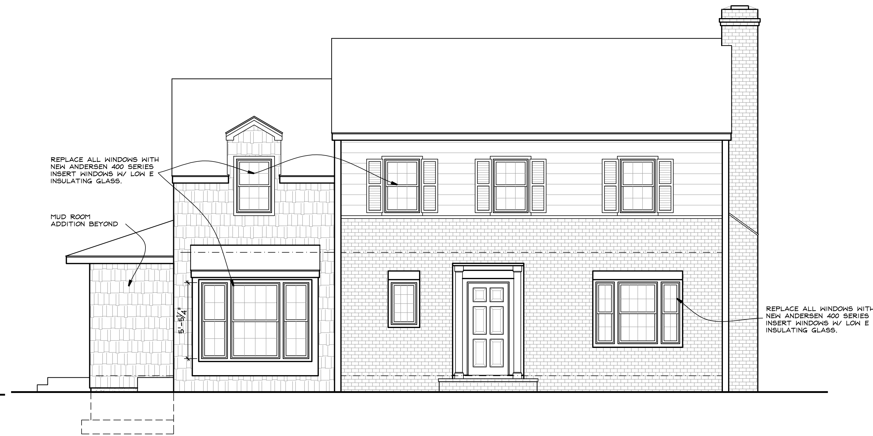
1 FRONT ELEVATION A2 1/4" = 1 FOOT