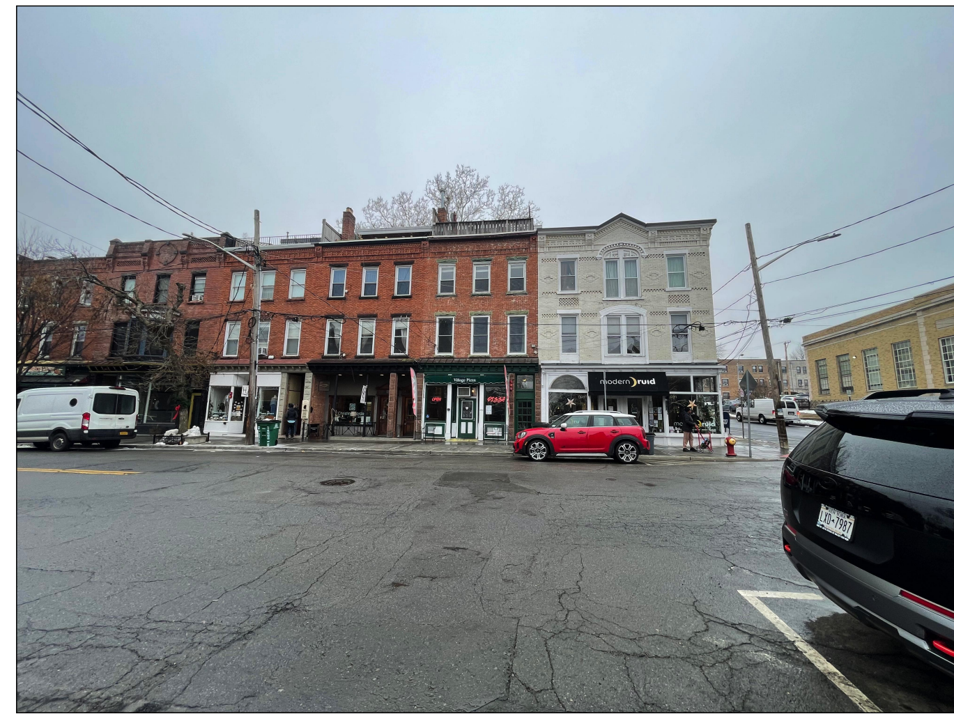
C OPP STRUCTURE (WEST)