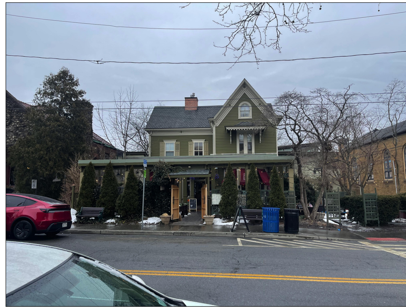
B ADJ STRUCTURE (NORTH)