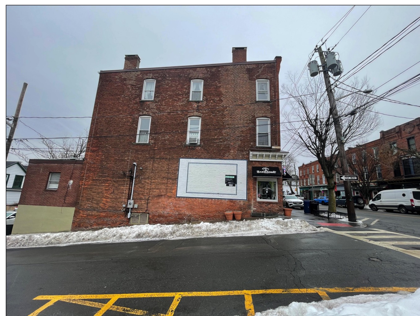
D OPP STRUCTURE (SOUTH)