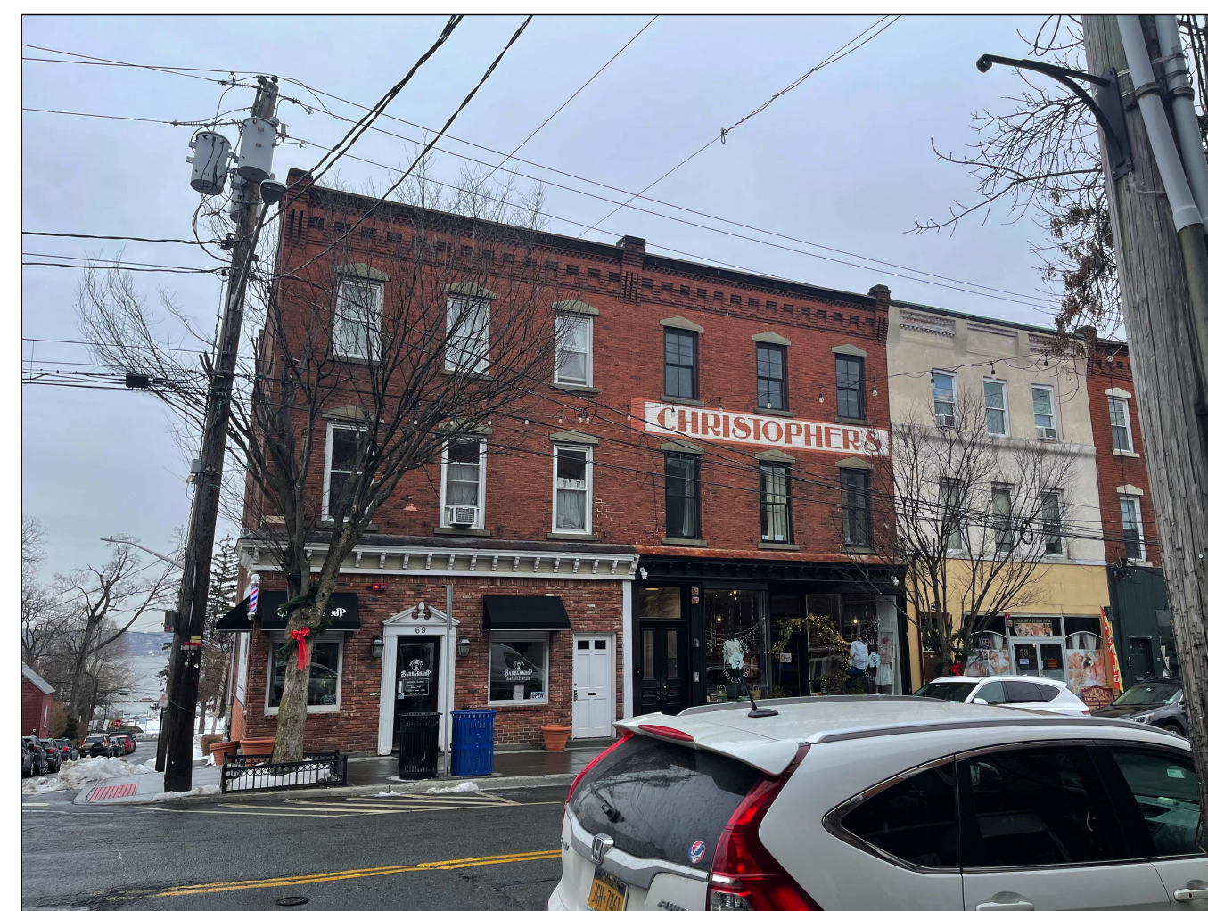
2 CONTEXT PHOTOS