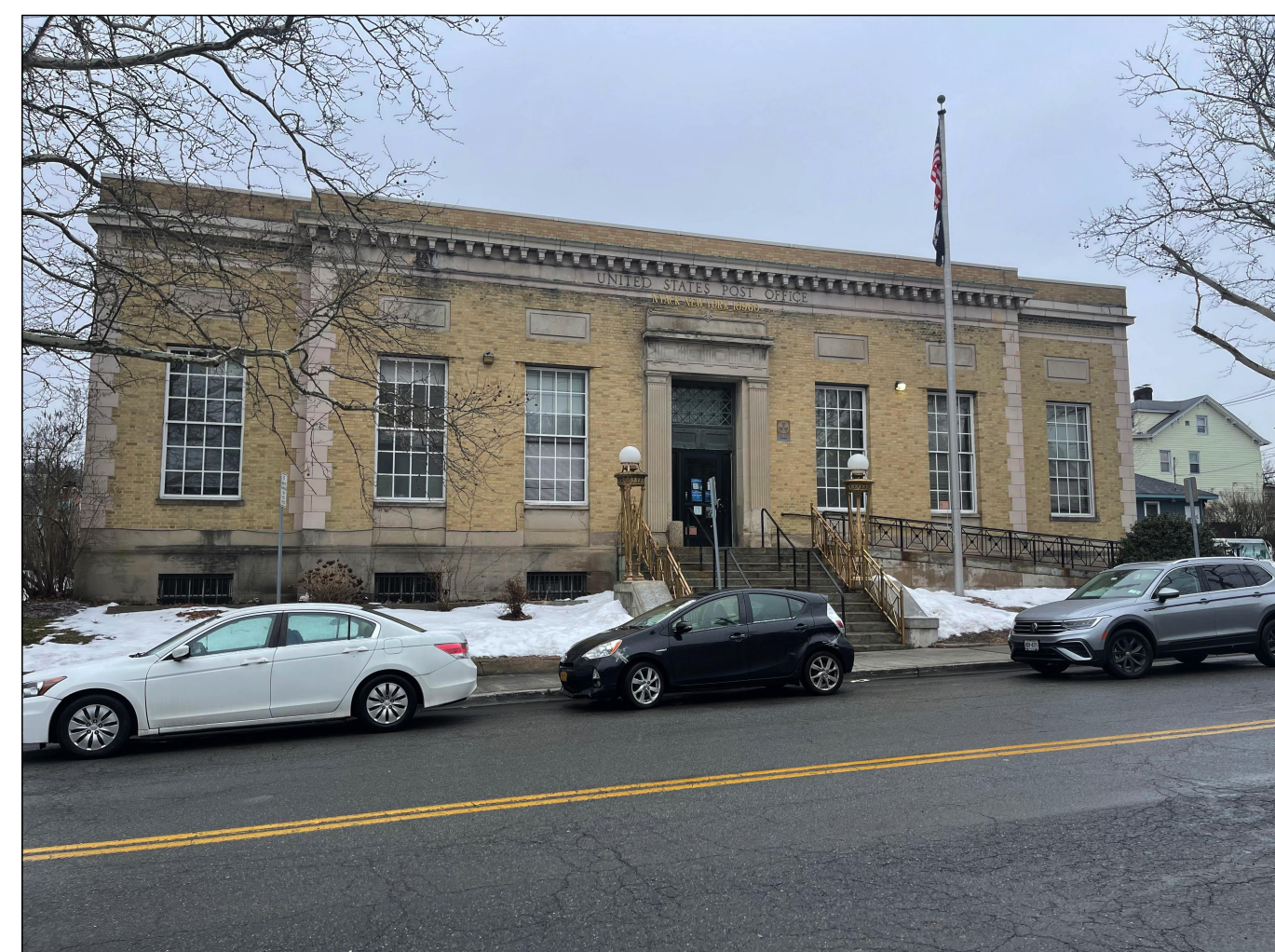
E OPP STRUCTURE (WEST)