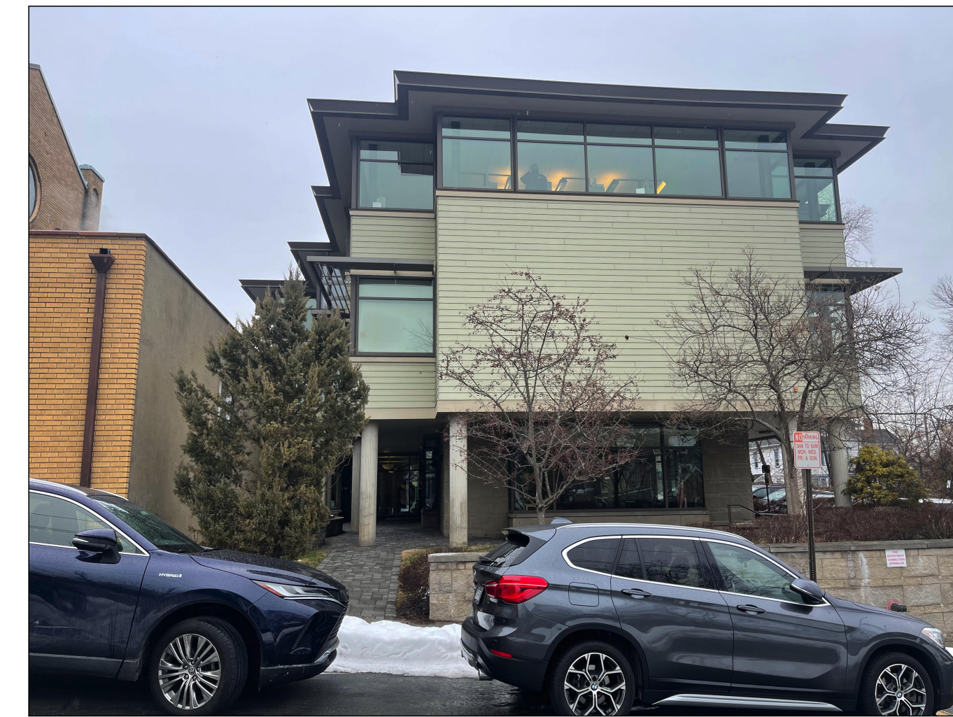
A ADJ STRUCTURE (EAST)