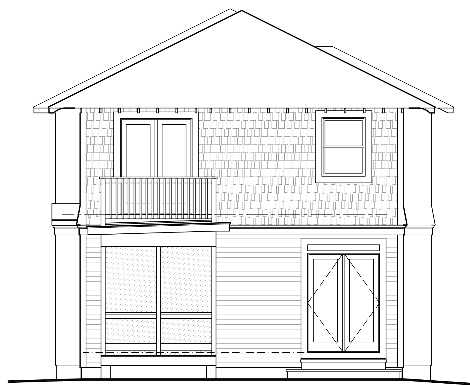
(C) REAR (WEST) ELEVATION A3 1/4" = 1 FOOT