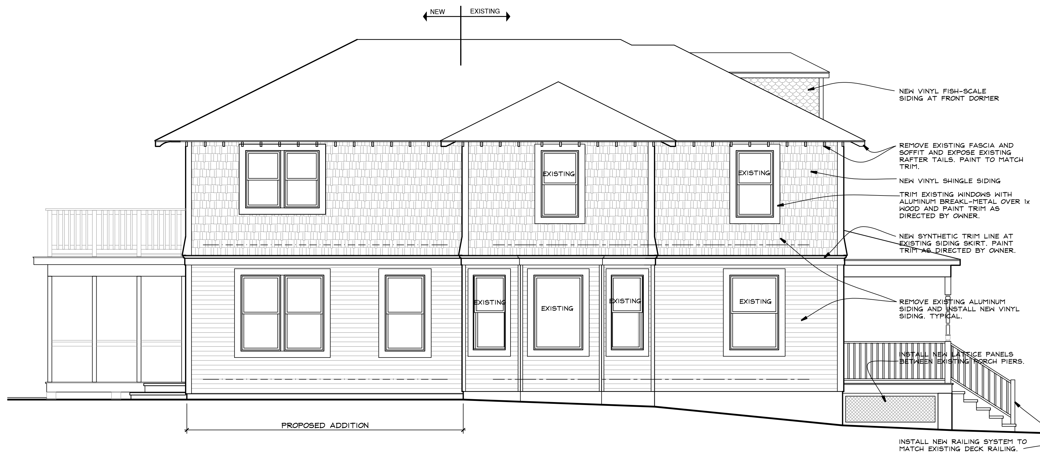
(B) SOUTH ELEVATION A3 1/4" = 1 FOOT