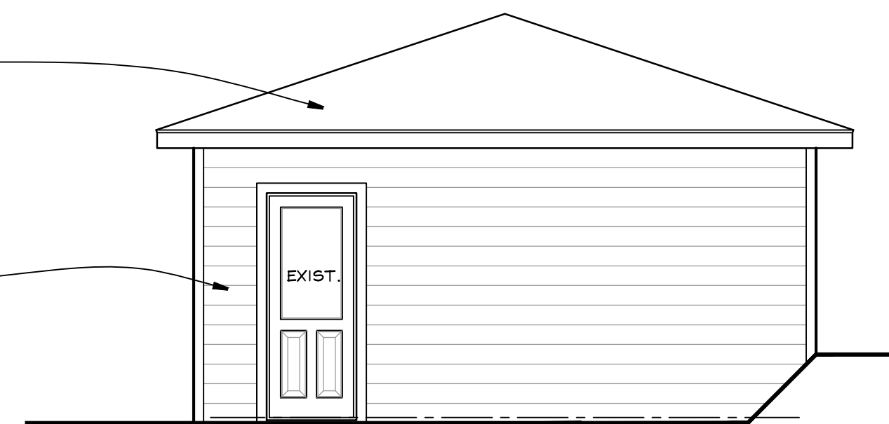
④ NORTH ELEVATION A4 1/4" = 1 FOOT