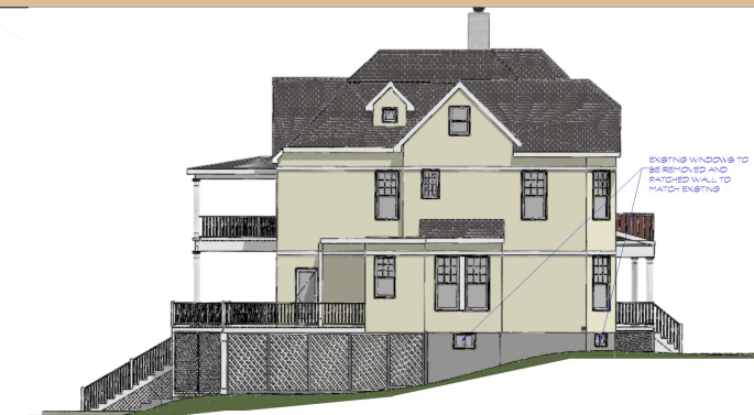
EXISTING RIGHT ELEVATION SCALE: 1/8" = 1'-0"

NOTE: CONTRACTOR SHALL PROVIDE WINDOW SPECIFICATIONS TO ARCHITECT PRIOR TO ORDERING FOR ARCHITECT'S REVIEW. NOTE: NOTED EGRESS WINDOWS SHALL MEET NY STATE EGRESS CODES (3.7 SQUARE FEET, 20" WIDTH, 24" HEIGHT MINIMUM) IN STANDARD 6'-0" HEADER APPLICATION. EXISTING DOOR OR WINDOW TO REMAIN