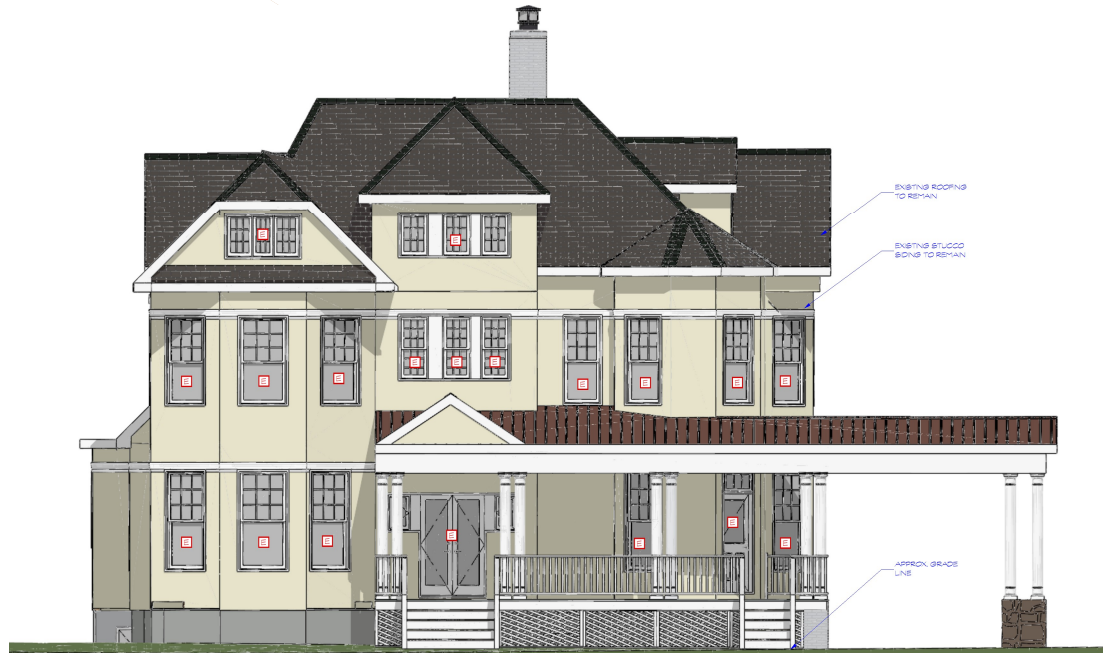
FRONT ELEVATION SCALE 1/4" = 1'-0"

NOTE: CONTRACTOR SHALL PROVIDE WINDOW SPECIFICATIONS TO ARCHITECT PRIOR TO ORDERING FOR ARCHITECT'S REVIEW. NOTE: NOTED EGRESS WINDOWS SHALL MEET NY STATE EGRESS CODES (3.7 SQUARE FEET, 20" WIDTH, 24" HEIGHT MINIMUM) IN STANDARD 6'-0" HEADER APPLICATION. EXISTING DOOR OR WINDOW TO REMAIN