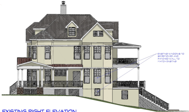
EXISTING RIGHT ELEVATION