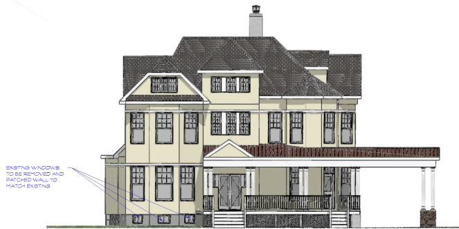
EXISTING FRONT ELEVATION SCALE 1/8" = 1'-0"