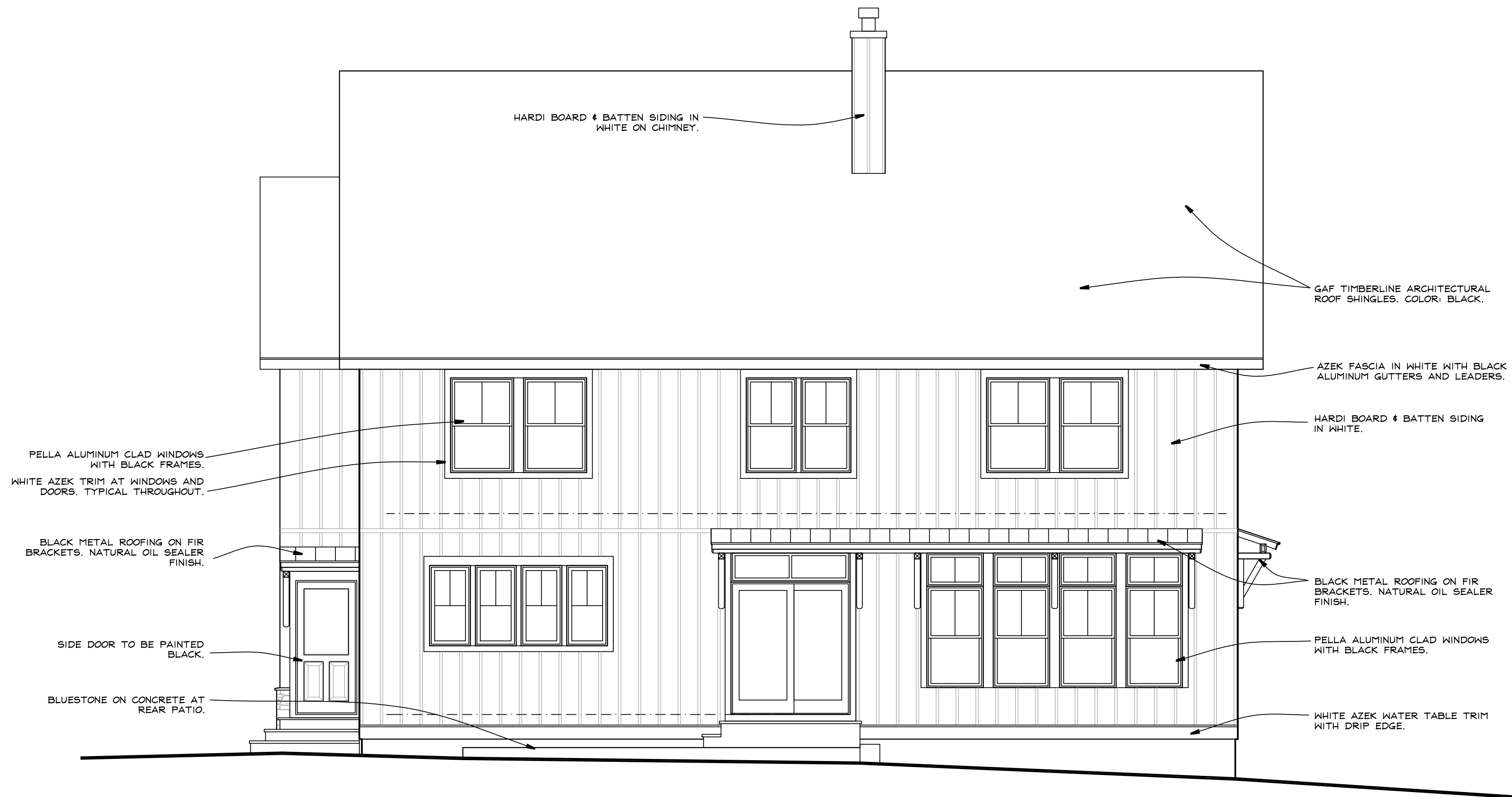
(C) REAR (SOUTH) ELEVATION A5 1/4" = 1 FOOT