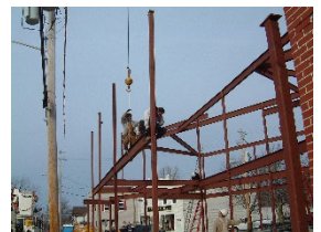
STRUCTURAL / MARINE