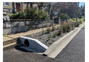
Town Hall Bioretention, Berterton, MD