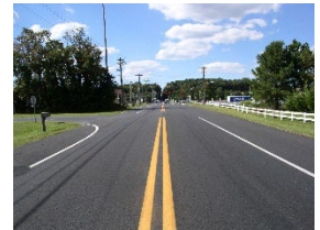
CIVIL / MUNICIPAL