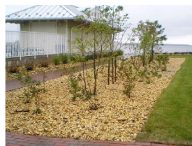
SITE / SUSTAINABLE