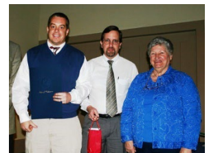
Accepting the DE Governor's Conservation Award

In our analysis, we consider multiple factors, including the goals of the client, the ability to maintain the green techniques, the ability to contribute financially, and the possibility of grant funding. Our knowledge and experience help us guide the project to success for all parties. At GMB, we believe that no project is too small when improving the quality of life and our waterways on the Delmarva Peninsula.