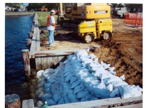
Elimination of "duckwalk" to solve flooding issues on Water Street, Cambridge, MD