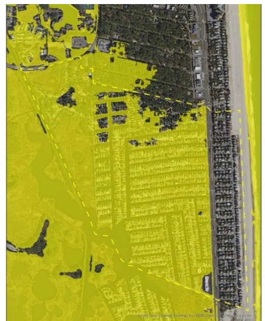
Exhibit Depicting the New MSL After Four Feet of Sea Level Rise

The inundation maps were reviewed to determine that limited options were available to the Town with the current code, state, and federal regulations, lay of the land, and constraints on budgets and capacities to move forward with large-scale alterations without disrupting the entire landscape of the Town. Bearing these limitations, some simple, low or zero-cost next steps were laid out that can allow for future assistance and mitigation techniques to make the greatest impact.