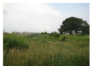
Wetland Restoration Bayside, Selbyville, DE