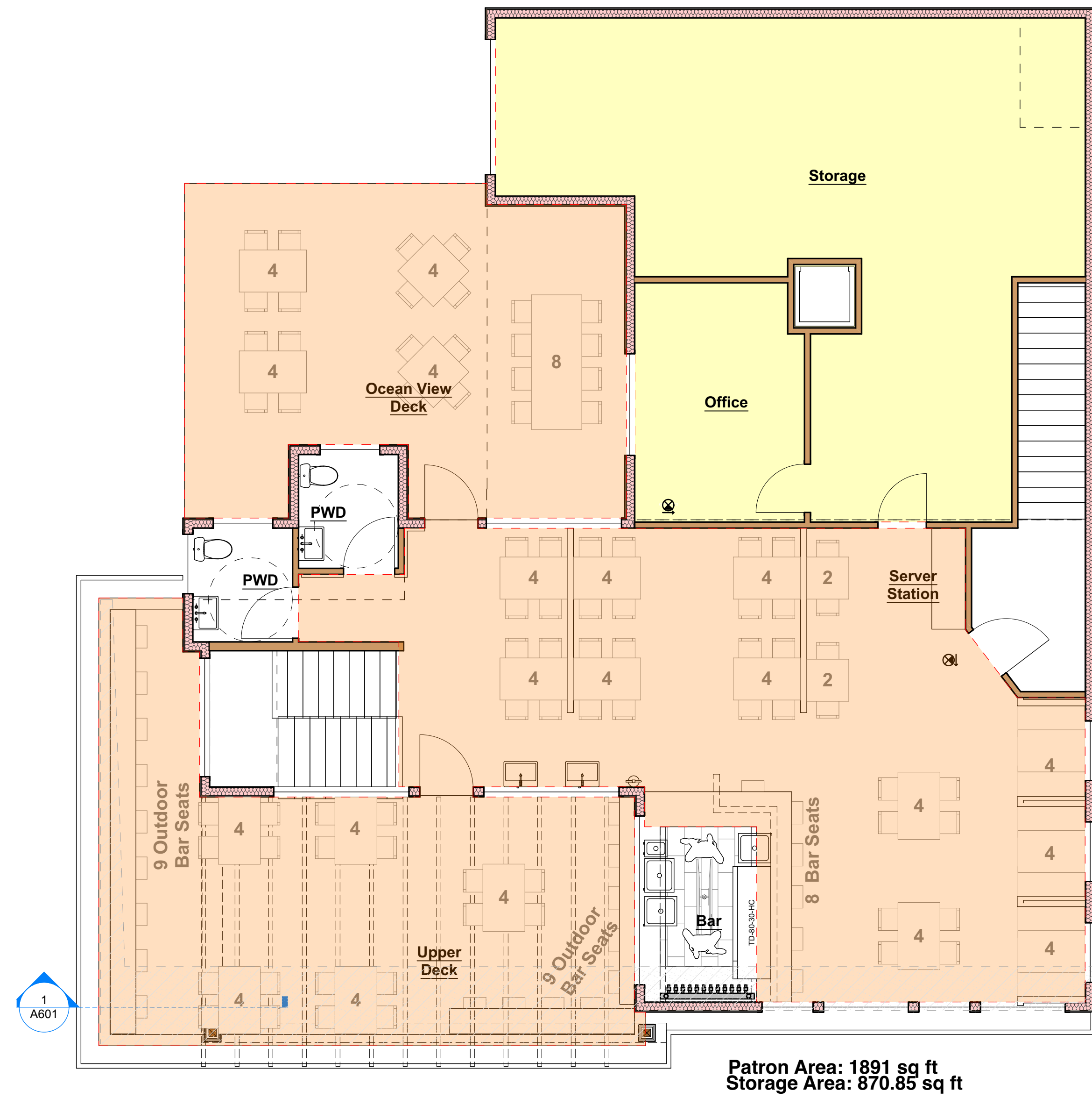
1 Upper Level - Patron Calculation SCALE: 3/16" = 1'-0"