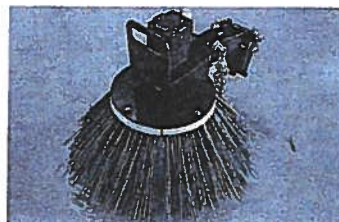
OPTIONAL GUTTER BRUSH