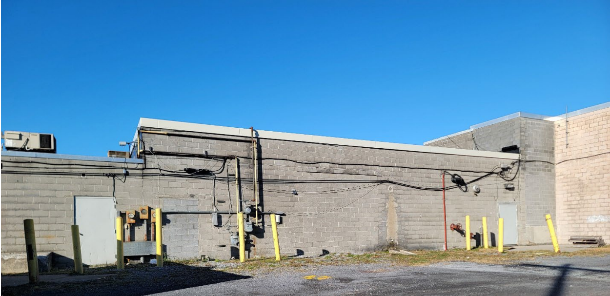
Above: Picture of the proposed storefront from the rear, from the east looking west.