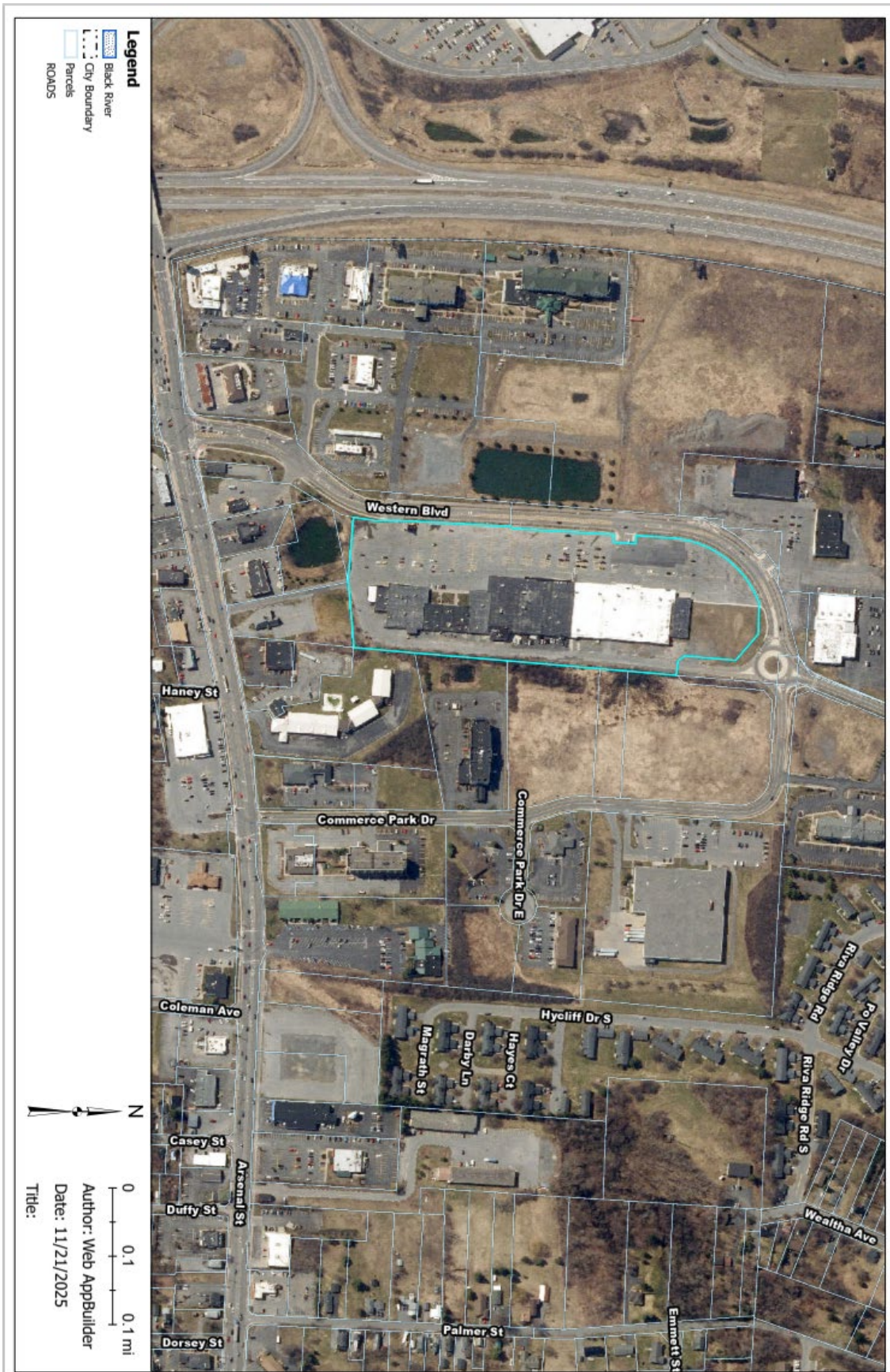
Above: A satellite view of the subject parcels highlighted in blue and their surroundings.