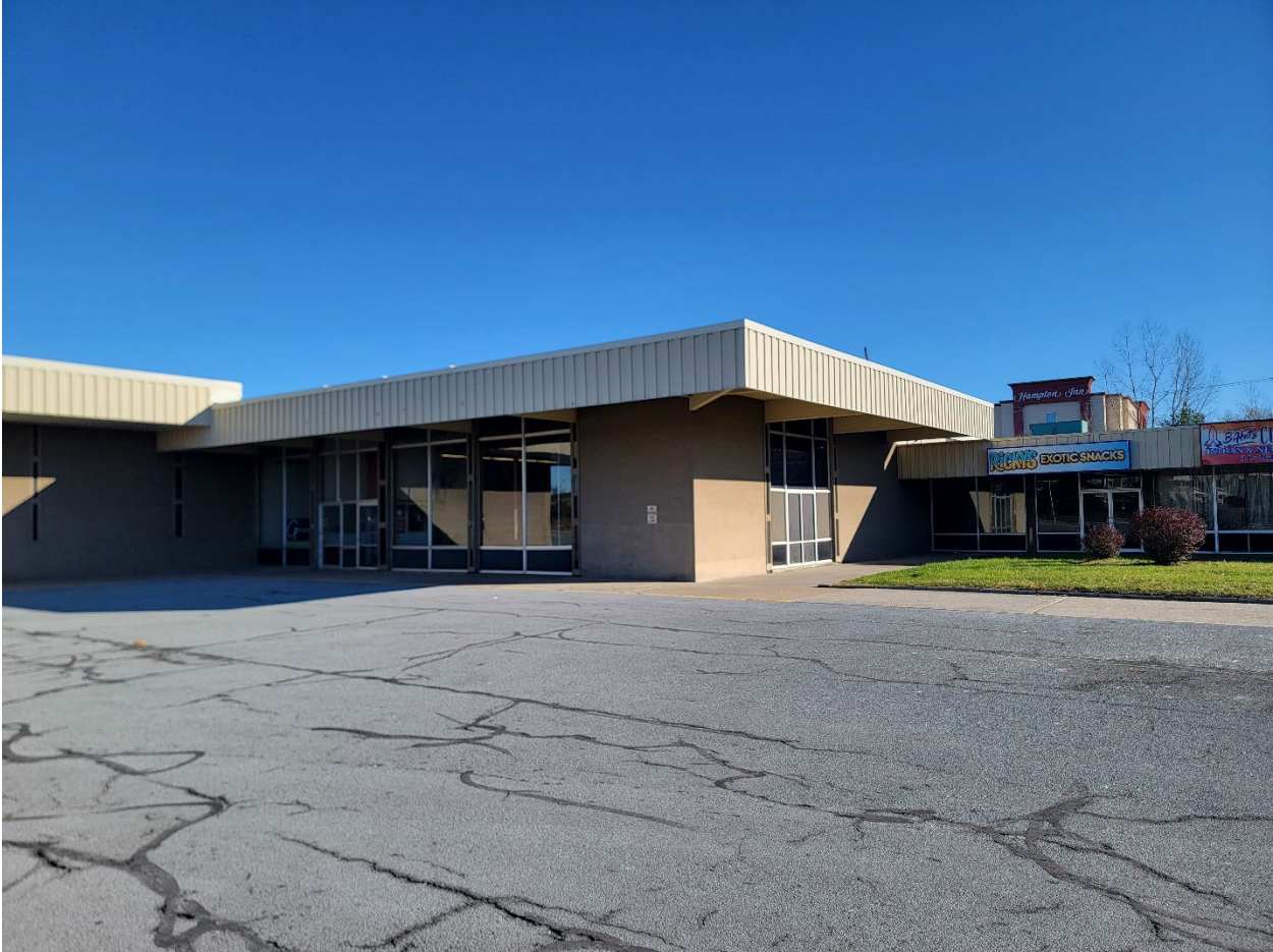
Above: Picture of the proposed store front from the front, from the west looking east.