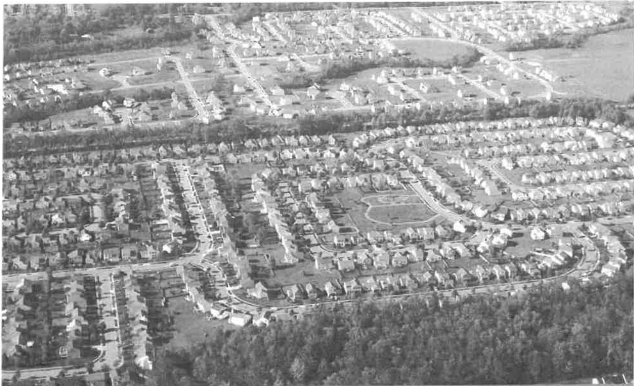
➡ The prevalence of single-family zoning in the United States is challenged by major demographic and social changes.

What's more, as we write this article, the U.S. economy appears to be headed for a slowdown, triggered by the COVID-19 pandemic that has swept the world. As potentially millions of Americans face job losses and pay decreases, the need for affordable housing options will become only greater.