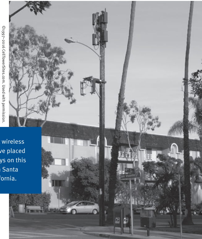
Two different wireless providers have placed antenna arrays on this utility pole in Santa Monica, California.

regulations. Any other permitting regulations should be secondary to this and should require a zoning or land-use permit under the local wireless facility regulations before obtaining any other permit.