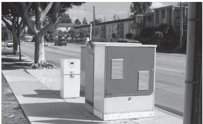
⤷ These wireless communications equipment cabinets are located in the public right-of-way between the curb and the sidewalk.

Make sure the community’s wireless facility regulations expressly state that even though a new structure may be proposed to go in the PROW, and notwithstanding anything else to the contrary, such a new structure, regardless of its location, height, or appearance, should be defined as first, foremost, and always a (wireless) communications tower or facility that is subject to the local wireless facility